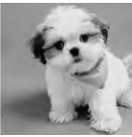
SHIH-TZU PUPPIES Beautiful Males & Females Price to Sell Call 718-306-4136