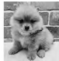
POMERANIAN PUPPIES Adorable males and females, toy or teacup sizes, shots and papers. Call 718-306-4136

PORTUGUESE WATER DOG PUPPIES AKC Breeder of Merit Application @ DoceuKennel.com Written Health Guarantee! Call 716 435-9922