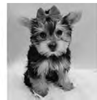
YORKIE PUPPIES ADORABLE, pure bred, toy & teacup sizes. Call 718-306-4136