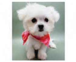
MALTESE PUPPIES Adorable males and females, toy or teacup sizes, shots and papers. Call 718-306-4136

PORTUGUESE WATER DOG PUPPIES AKC Breeder of Merit APP required @ Doceukennel.com Written Health Guarantee! Call (716) 435-9922