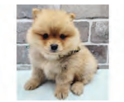
POMERANIAN PUPPIES Adorable males and females, toy or teacup sizes, shots and papers. Call 718-306-4136