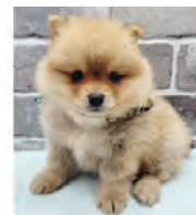
POMERANIAN PUPPIES Adorable males and females, toy or teacup sizes, shots and papers. Call 718-306-4136