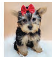
YORKIE PUPPIES ADORABLE, pure bred, toy & teacup sizes. Call 718-306-4136

Too cute! Puppies, Kittens, Dogs, and Cats To sell them in the New York Post Classifieds Email clloyd@nypost.com