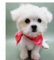
MALTESE PUPPIES Adorable males and females, toy or teacup sizes, shots and papers. Call 718-306-4136