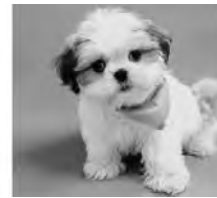
SHIH-TZU PUPPIES Beautiful Males & Females Price to Sell Call 718-306-4136