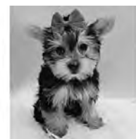
YORKIE PUPPIES ADORABLE, pure bred, toy & teacup sizes. Call 718-306-4136