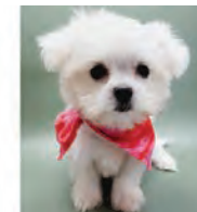
MALTESE PUPPIES Adorable males and females, toy or teacup sizes, shots and papers. Call 718-306-4136