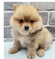
POMERANIAN PUPPIES Adorable males and females, toy or teacup sizes, shots and papers. Call 718-306-4136