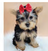
YORKIE PUPPIES ADORABLE, pure bred, toy & teacup sizes. Call 718-306-4136

Too cute! Puppies, Kittens, Dogs, and Cats To sell them in the New York Post Classifieds Email clloyd@nypost.com