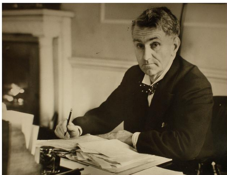
Thomas Johnston MP – an honest politician who exposed honest money!

I came across the writings of another Privy Councillor, only this time he was active in the 1930s. His name was the Rt. Hon. Thomas Johnston MP – a Labour politician who has become known to history as the father of the Scottish hydro-electric power programme and someone for whom nobody had a bad word to say about. In 1934, he wrote a book, The Financiers and the Nation , and in Chapter 6 entitled ‘Usury on the Great War’... ( http://archive.sustecweb.co.uk/past/sustec12-6/extract_from_the_financiers_and.htm ), ...the whole shocking truth about money creation and money supply comes into focus for first real time.