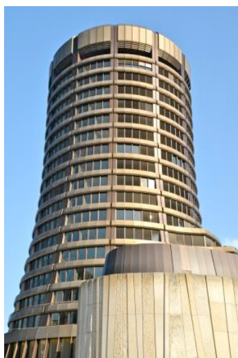
The Deep State personified – 'The Evil Tower of Basle'

Based in Basle, Switzerland, this Bank for International Settlements has seen fit to give itself high-level diplomatic immunity so that it can protect its activities from prying eyes. In fact, the BIS completely relies upon people not knowing much, if anything, about it, even about its very existence. Indeed, it's likely that ninety-nine per cent of the British people have no idea at all about what this bank actually does, including it has to be said the majority of our elected servants in Parliament. Nearly everyone has heard of the IMF, the OECD and the World Bank but the BIS prefers to do its job by keeping itself well below the radar of public consciousness.