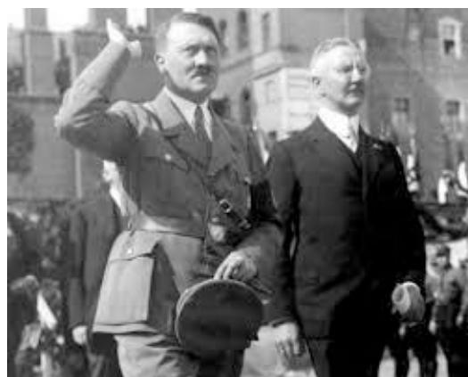
Hjalmar Schacht (left) with his old friend and BIS collaborator Montagu Norman, and (right) doing his job as 'Hitler's banker'