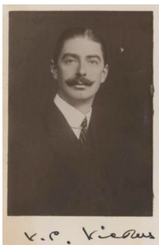
Vincent Vickers, Director of the Bank of England 1910-19 and a man of far-sighted integrity

"The supply and issue of money and the creation of credit still remain almost entirely outside the control of the Government, and are still managed by Banking and Finance and by the Bank of England with its intimate associations with the Bank for International Settlements; whilst, until our actual declaration of war, Foreign Exchange speculators were permitted at all times to gamble with the nation's credit, untrammelled by any sense of patriotic duty and thinking only of their own profit... Until these financial Gangsters are permanently exterminated there can be no complete confidence in the economic welfare of the country".